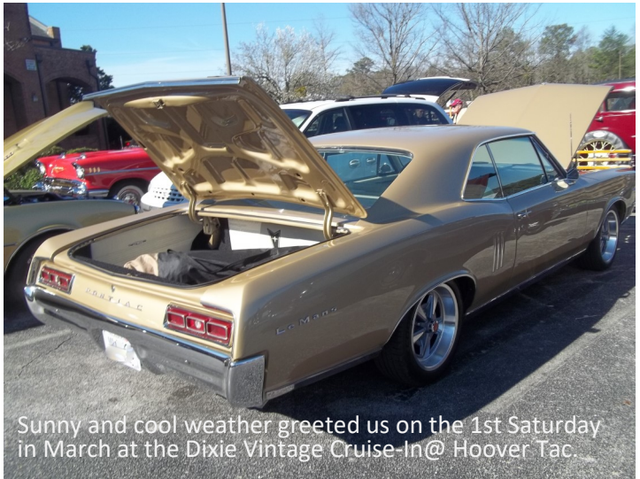
Sunny and cool weather greeted us on the 1st Saturday in March at the Dixie Vintage Cruise-In@ Hoover Tac.

7001 Crestwood Boulevard Suite 112 Birmingham, AL 35210