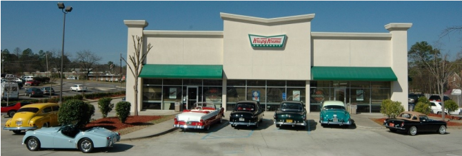
Hoover Krispy Kreme hosts Dixie Vintage Auto Club's first Saturday Cruise-In each month.