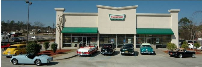
Hoover Krispy Kreme hosts Dixie Vintage Auto Club's first Saturday Cruise-In each month.