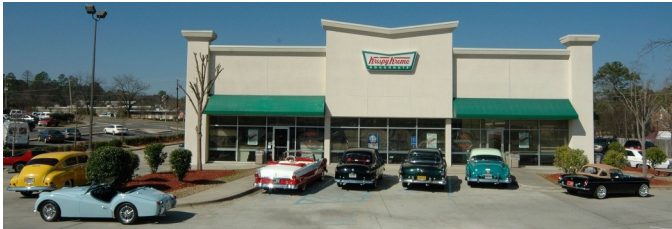
Hoover Krispy Kreme hosts Dixie Vintage Auto Club's first Saturday Cruise-In each month.