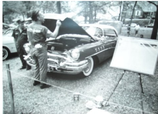
Dad polishing the car prior to a show in Columbus, GA, 1976