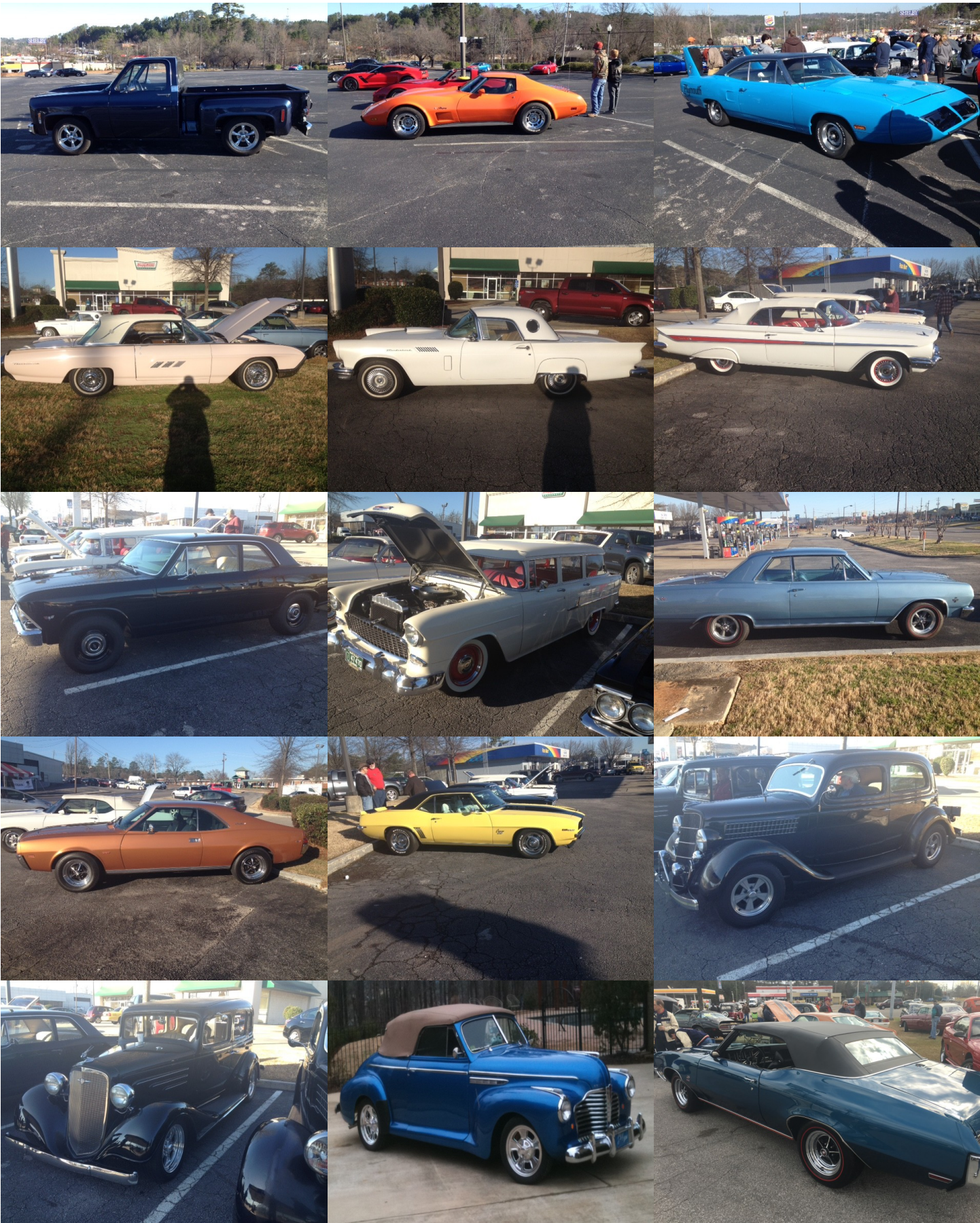
Dixie Vintage Antique and Classic Car Show...